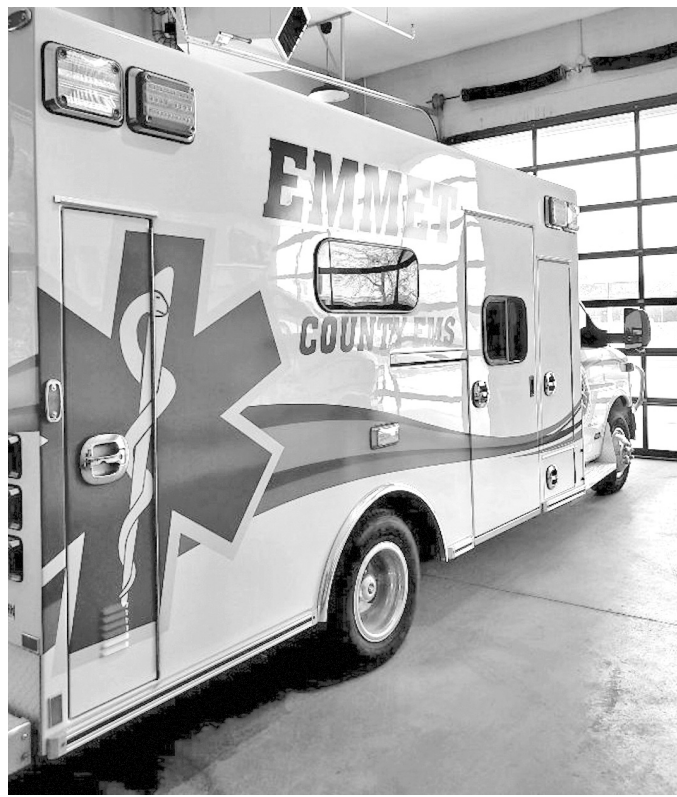
Emmet County Emergency Medical Service (EMS) took delivery in January of the first of two remounted Braun ambulances budgeted for 2020.

The second remounted ambulance is scheduled to be delivered to the Braun