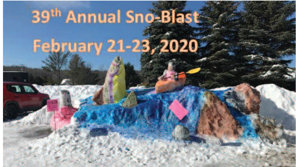
Starting on Friday, February 21 and continuing on Saturday and Sunday, East Jordan will be hosting its 39th annual Sno-Blast.

Events will be taking place at the Snowmobilers Club House and in downtown East Jordan. While