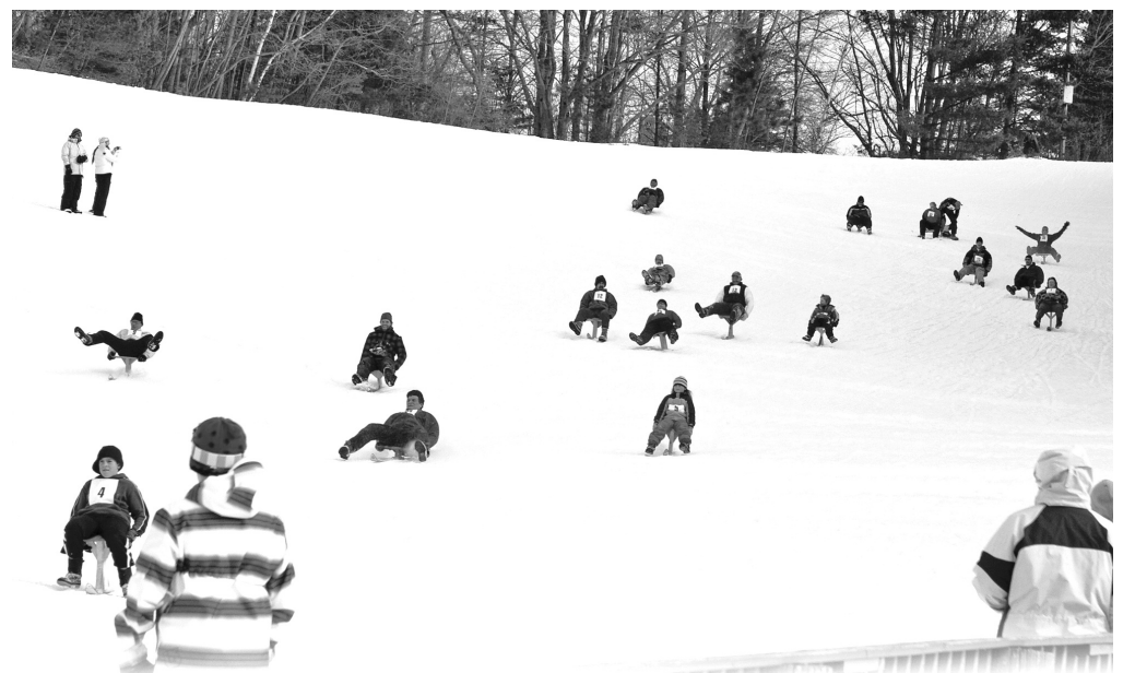
Bumpjumping is a very popular Winter Carnival event, where participants race down the hill aboard a unique contraption featuring a seat mounted to a ski.

There will be a Cardboard Sled workshop at the Petoskey District Library from 10 am - 2 pm. Have you wanted to build your own cardboard sled to compete in the Winter Sports Park Cardboard Sled challenge? Well, Petoskey District Library has you covered. Cardboard and