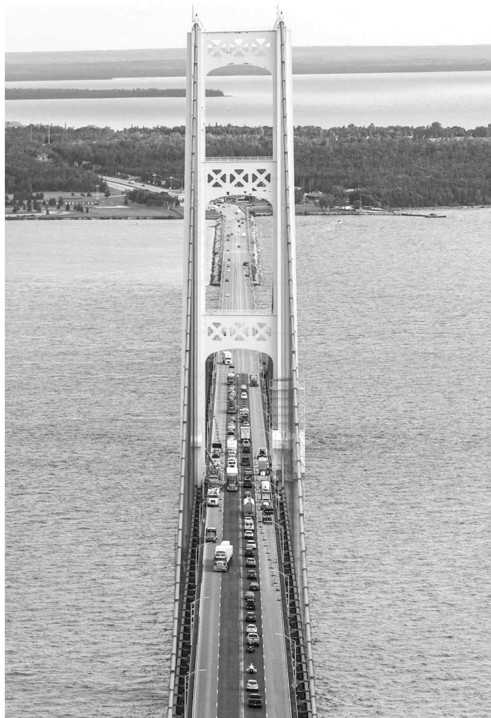
The Mackinac Bridge tower painting project, now entering its fourth and final year, has won a second national award.

The south tower contract is for just less than $6.5 million, with Seaway required to complete the project by Dec. 31. The contract to repaint the north tower was just less than $6.3 million. Installation and removal of the platforms has required brief closures